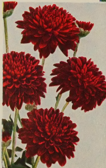
HERO. 60c each; 3 for $1.50